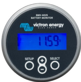
BMV 602S Black