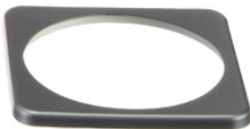
BMV bezel square