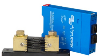
VE.Net Battery Controller

No prescaler needed. Note: RJ45 connectors are galvanically isolated from Controller and shunt.